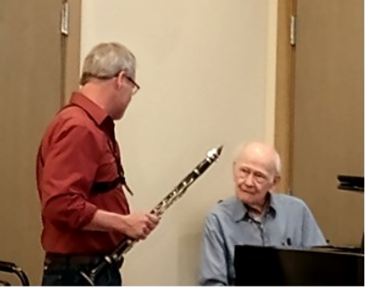
What a delight to hear such great musicians playing off each others creativity!!